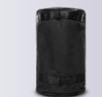
LIGHT CARRY BAG