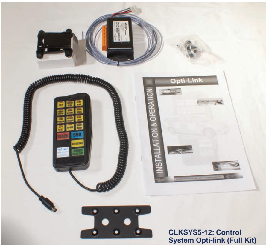
CLKSYS5-12: Control System Opti-link (Full Kit)